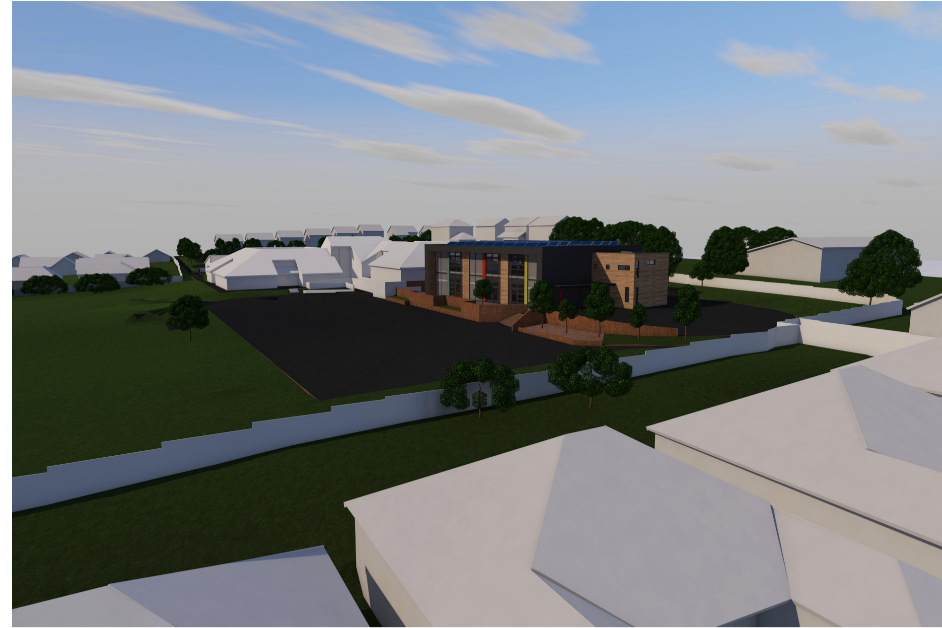
Visual showing relation of proposed new classroom extension to existing from the East