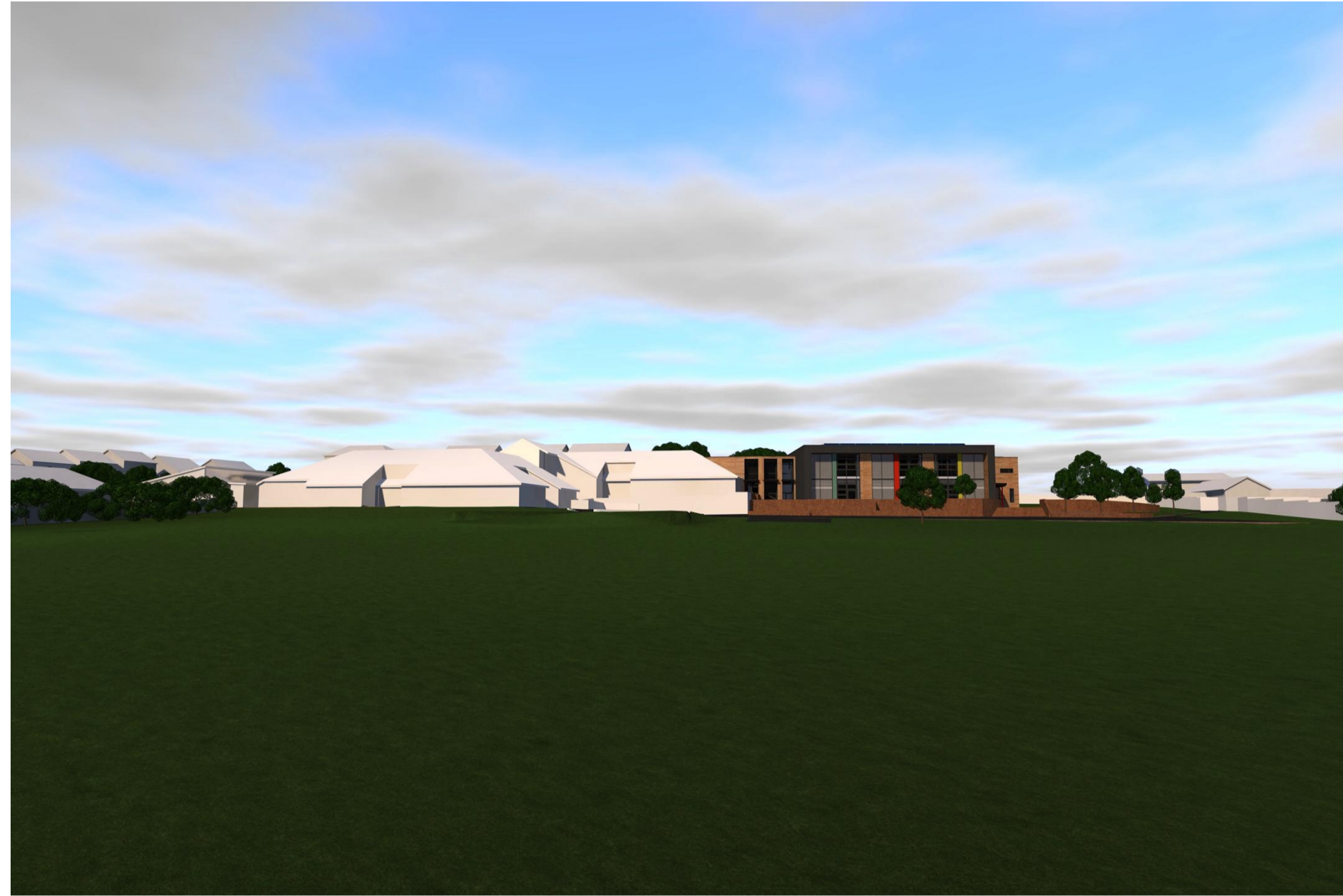
Visual showing relation of proposed new classroom extension to existing from the playing field